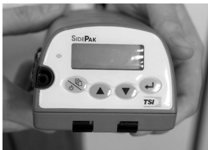
Figure 1 The TSI SidePak AM510 Personal Aerosol Monitor.

Figure 2 compares the average air pollution levels in places with and without smoking stratified by four types of location; (1) bars, (2) restaurants, (3) transportation venues and (4) other types of venue. Venues with smoking had significantly higher